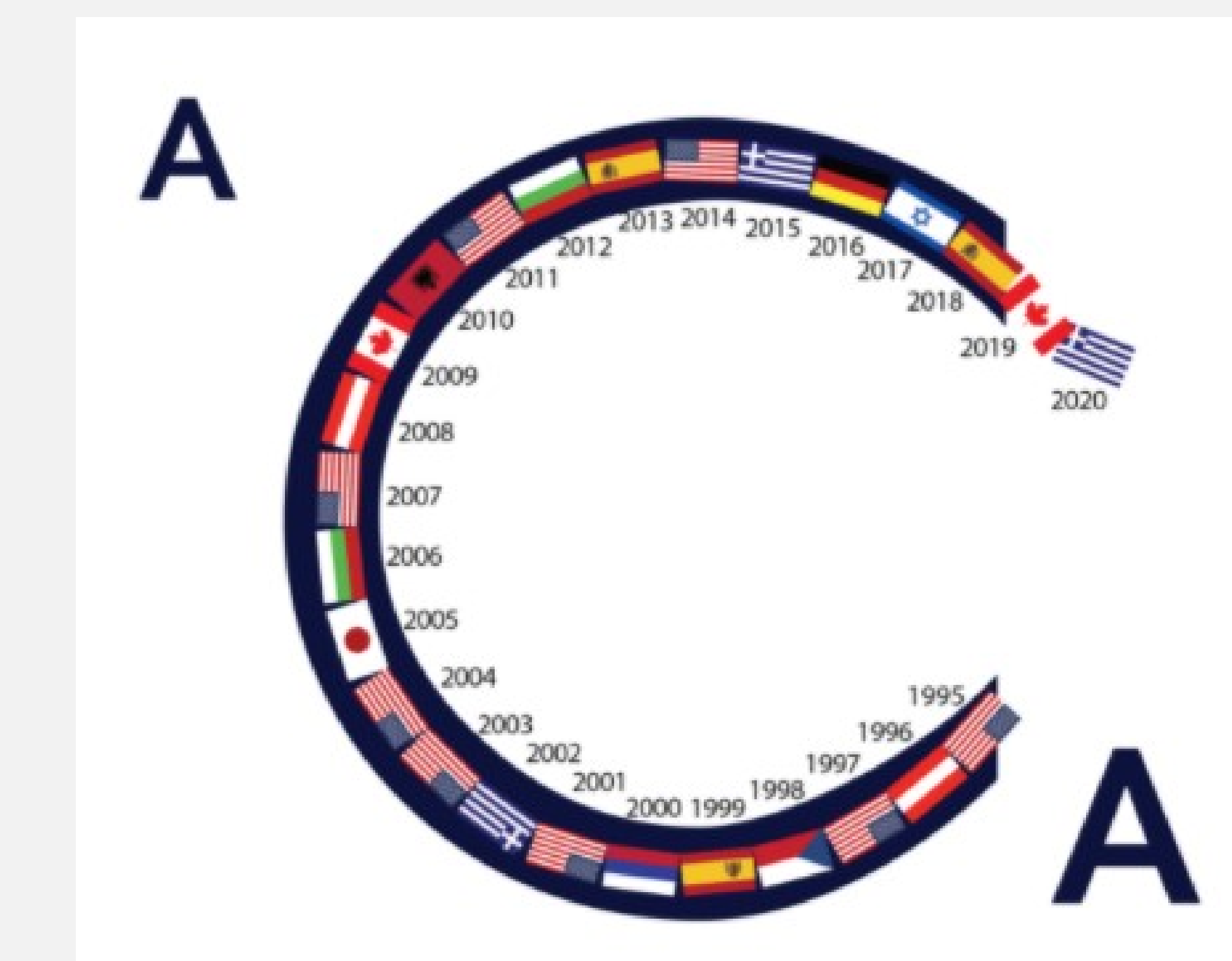
Countries of the first 25 ACA conferences